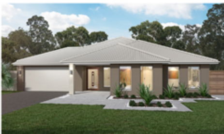
Classic I Facade