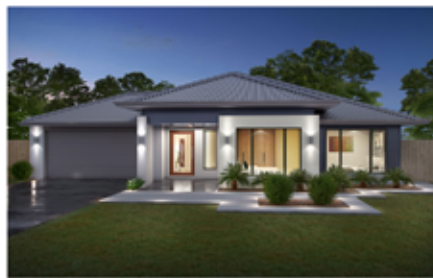
Contemporary II Facade