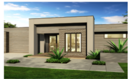
Urban I Facade

P 07 5491 7084 E sales.sc@ntqh.com.au W www.nutrendhomes.com.au